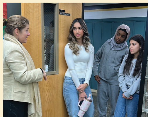
Members of the Board of Education recently were at Roth Junior High School. Board members visit each school every year.