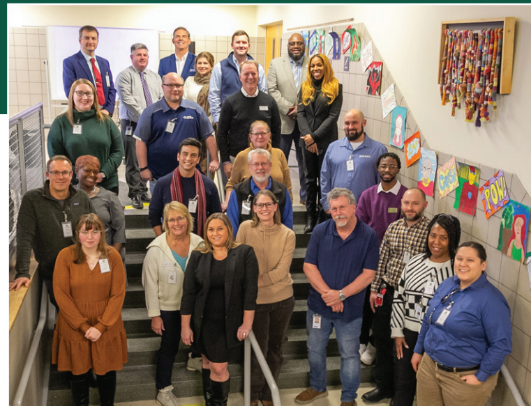
Local business leaders joined us in January to learn more about creating partnerships with the district.